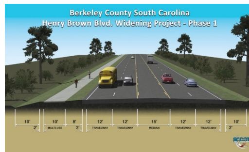
Project Development Approximately 100% Complete, See Attachment "A"

We have a major change order, $211,500.00, for additional Full Depth Patching 8" Unif. Originally, the contract had a quantity of 100 sy at a cost of $90.00/sy and quantity has increased due to the tremendous deteriorated of the roadway since the pavement was review. Currently, the quantity for the patching has increased to 3,000sy. This would have equated to the increase in the contract by $260,000.00. L&L has agreed to lower until price to $73.50/sy due to increased quantities.