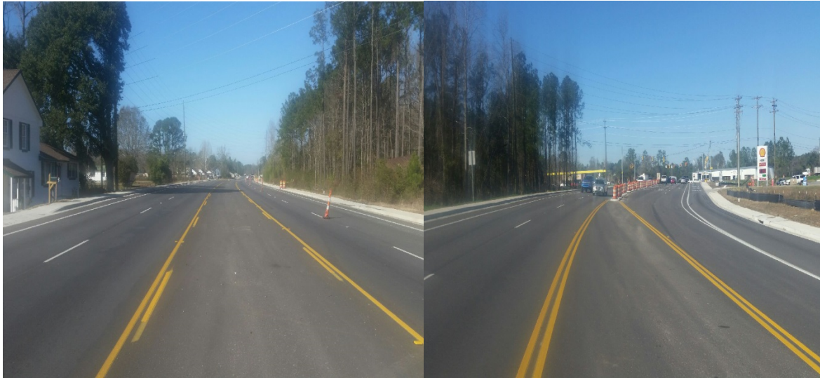
Project Development Approximately 100 % Complete, See Attachment "A"

All change orders have been completed and approved.